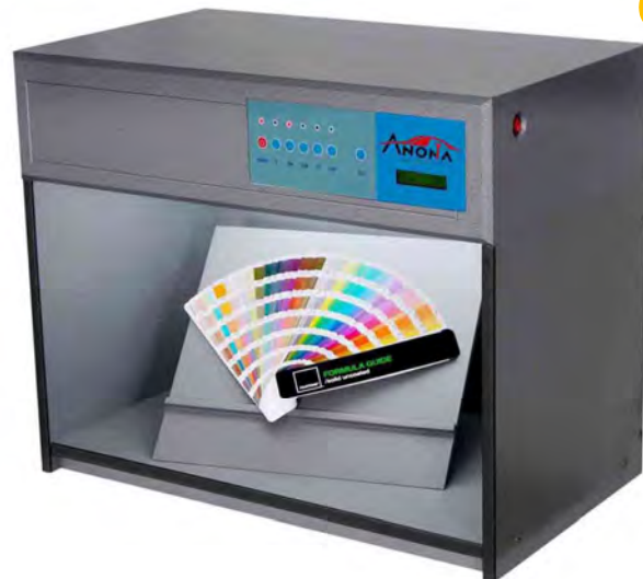
Part Code: AT-5

It has wide applications in Inks, Graphic arts, Textile, Packaging, Leather, Plastic, Ceramics, Knitwear, Photographic, Automotive , Printing and Dyeing industries.